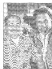
Car Talk Click and Clack Tom and Ray Magliozzi

In the 1960s, when I was an adolescent male, one of my friends told me that he could get his old car (late-1940s- or early-1950s-era) to "fart" whenever he liked. When I expressed skepticism about this claim, he demonstrated