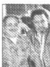
Car Talk Click and Clack Tom and Ray Magliozzi