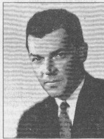
Robert F. Goheen

doors to women as graduate students in 1961 and as regular members of the undergraduate student body in 1969. Under Goheen's leadership, Princeton also implemented measures to attract a more racially and ethnically diverse group of students and faculty.