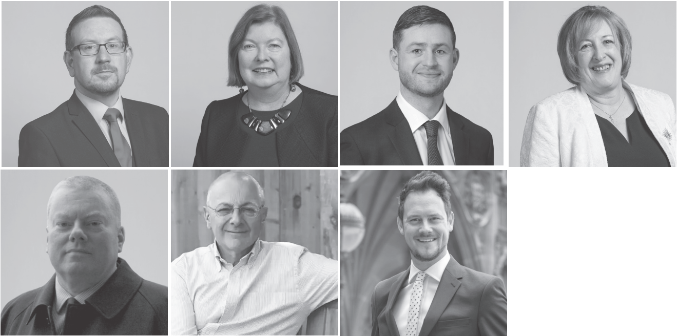
TOP ROW, FROM LEFT

Andrew Gwynne MP Shadow Secretary of State for Communities & Local Government