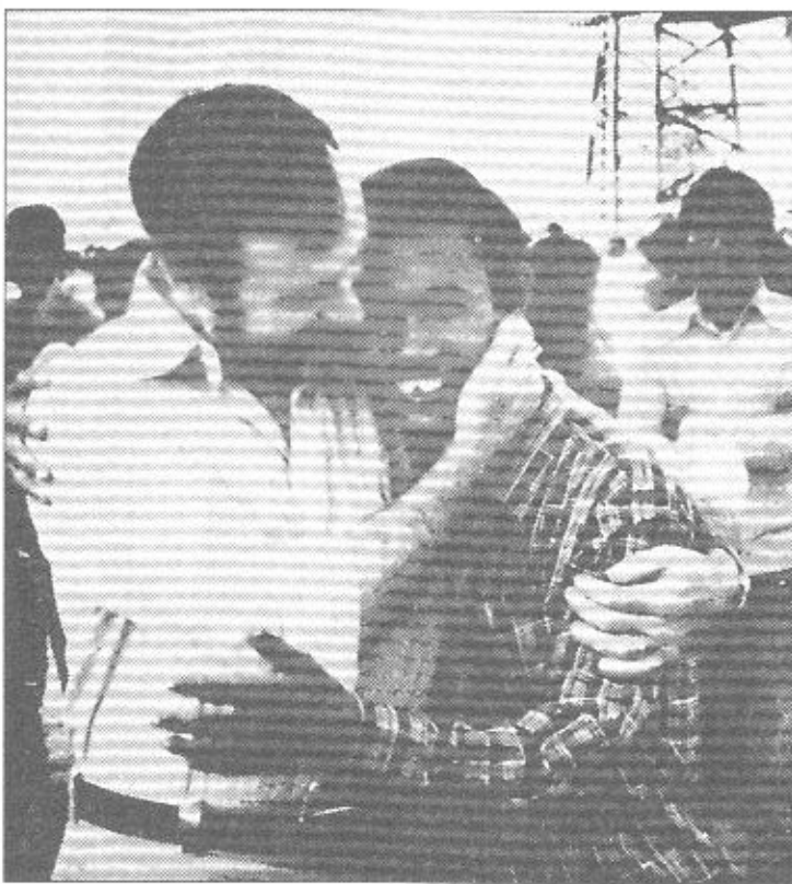
New York Times reporter Sydney Schanberg, left, hugs his former interpreter and assistant, Dith Pran, on Oct. 10, 1979, as they leave the Surin refugee camp in Thailand, where they had been reunited the day before.

"I'm a very lucky man to have had Pran as my reporting partner and even luckier that we came to call each other brother," Schanberg said. "His mission with me in Cambodia was to tell the world what