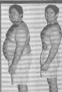
Lost 125 lbs. in 9 months

Appointments available in Lancaster, Columbia & Quarryville