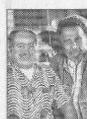
Car Talk Click and Clack Tom and Ray Magliozzi

TOM: This is going to sound like I'm pulling your leg, but I'm not. On this car, you turn your key to the "on" position (without starting the engine), and then press the gas pedal all the way down three times