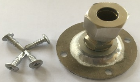
Dip Tube Assy

LEFT: The Dip Tube Assembly consists of a metal flange with fixing screws, as pictured. We recommend you seal with Hylomar Blue.