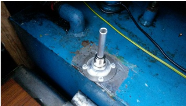
Above: Dip tube fitted to top of tank