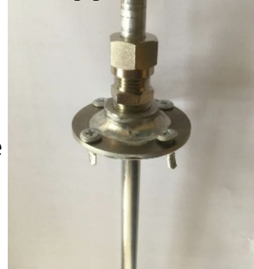
Shown with aluminium pipe fitted

RIGHT: The Dip Tube is a plate with a compression fitting that fixes to the top of the tank allowing a pipe to pass through to the bottom of the tank. The Diesel Dipper then sucks from the top of this pipe.