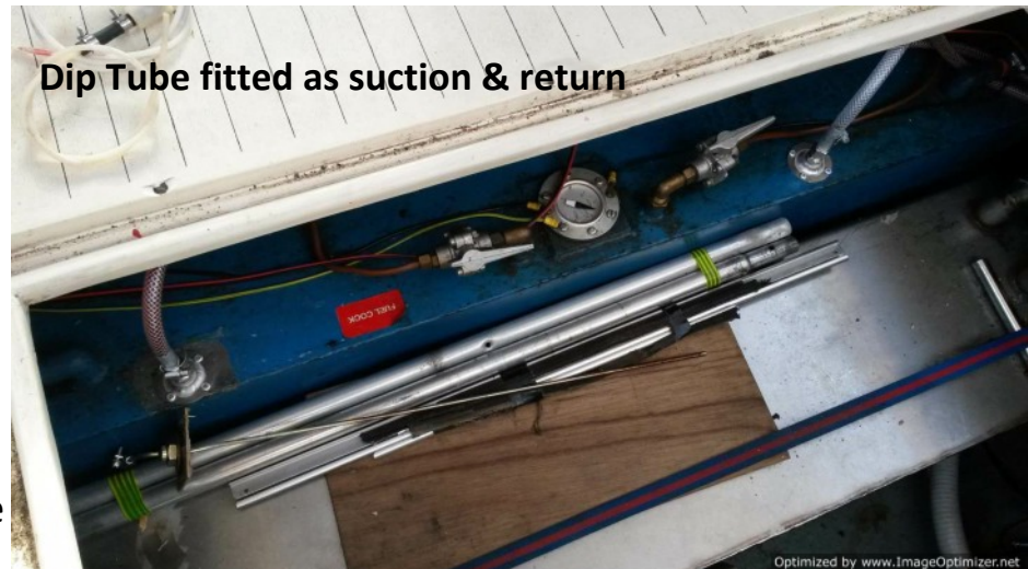
Dip Tube fitted as suction & return